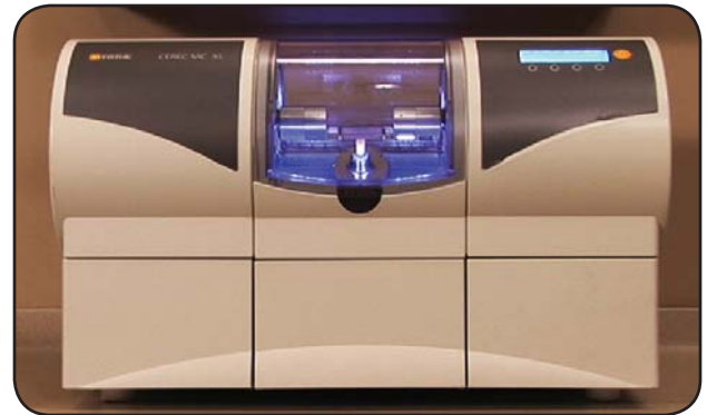
CAD/CAM milling machine